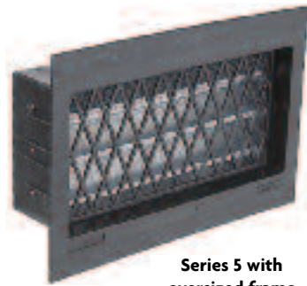
Series 5 with oversized frame